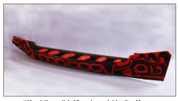
"Head Canoe" 1:12 scale model by Jim Heaton.

Heaton painted twelve ovoids on both sides of his model to represent these individuals.