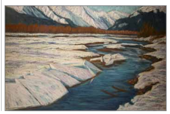
"Chilkat Breakup #1" and "Chilkat Breakup #2" pastel paintings by Beverly Schupp.

See all of these beautiful creations on display in the Museum's galleries.