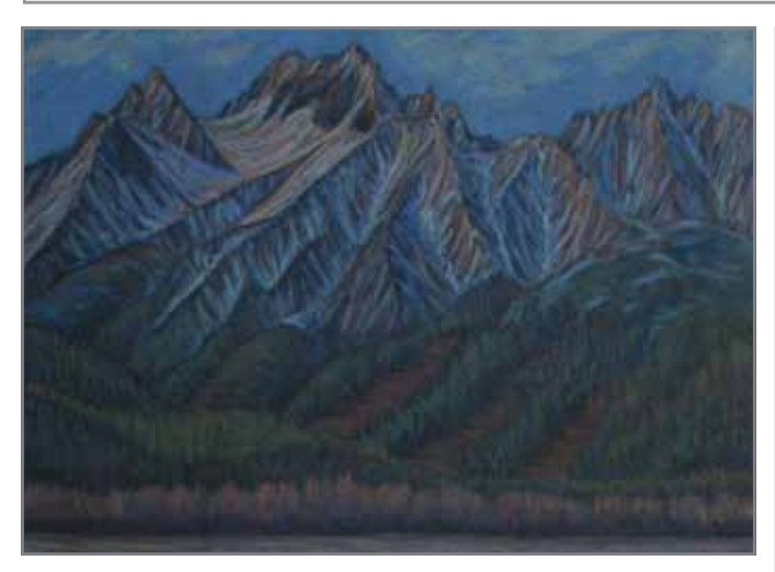
A pastel painting of the Chilkat Mountains by Beverly Schupp.

The ongoing Six Week Spotlight Program is designed to provide a way for local artists to put together museum-quality shows in a local venue. Since our last newsletter the following artists have had solo exhibitions.