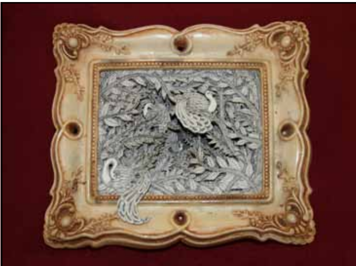
"Bird in Paradise" pen and ink drawing by Amelia Nash.

The Sheldon Museum announces the acquisition of 4 pieces of local art purchased with funds from the Rasmuson Foundation's Art Acquisition Initiative. The goal of this fund is to support living, practicing Alaskan artists through museum purchases, to enhance the permanent art collections of Alaskan museums, and to encourage Alaskan museums to develop formal collections policies.