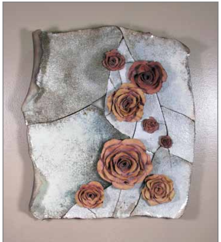
"Gathering" ceramic sculpture by Kerry Cohen.