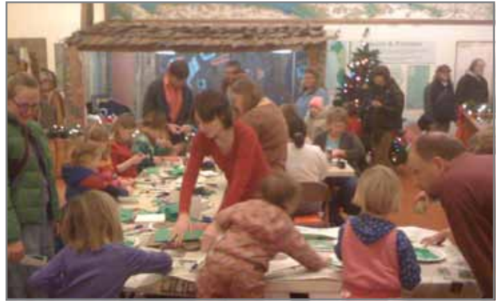
Craft making at the Museum's Christmas Open House.

Over the course of this winter, the Education Department was excited to continue traditional programs offered at the Sheldon Museum while introducing new activities for kids and adults.