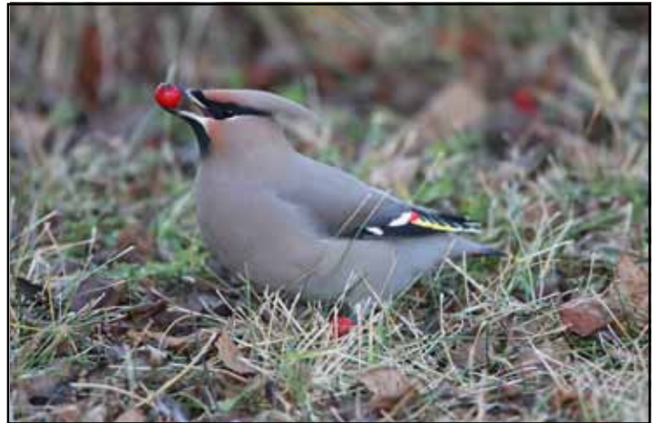
Ron Horn Wildlife Photography August 5th - September 17th