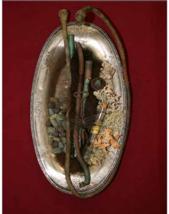
"Fly" assemblage art piece by Andrea Nelson.

The Sheldon Museum announces the acquisition of 4 pieces of local art purchased with funds from the Rasmuson Foundation's Art Acquisition Initiative. The goal of this fund is to support living, practicing Alaskan artists through museum purchases, to enhance the permanent art collections of Alaskan museums, and to encourage Alaskan museums to develop formal collections policies.