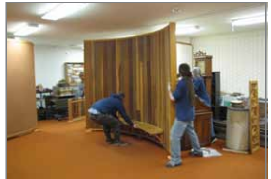
Top: Volunteers moving lower gallery walls. Bottom: New exhibits during the Open House.

The Lower Gallery is still a "work in progress" and will remain so for several years as the